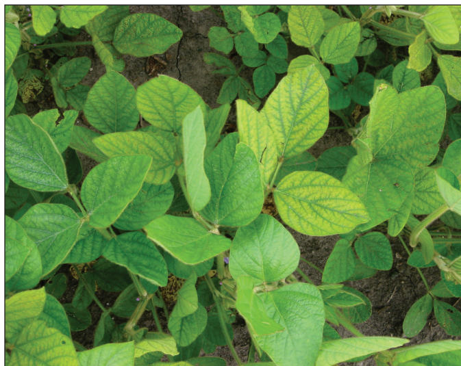
Figure 3. Manganese-deficient soybean plants.

Manganese (Mn) – One of the more common micronutrient deficiencies observed in soybeans is manganese (Mn), which is most likely to occur in coarse, dry, high pH and high organic matter soils. Manganese deficiency symptoms include interveinal chlorosis on the newest (topmost) leaves while the