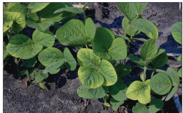
Figure 2. Potassium deficiency in soybeans.

Symptoms of K deficiency include yellowing of the margins of the leaves, starting with the older, lower leaves. Note the yellowing pattern beginning at the leaf margins in Figure 2.