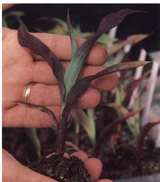
This purpling does not affect stand, growth or yield.

When corn plants emerge, it's not uncommon for seedlings to have a purplish tint or some uneven early growth. These observations often worry some corn growers. However, when the purple color disappears - usually after the six-leaf stage - so do growers' concerns. The ultimate goals of corn production are harvestability and yield, and current evidence shows purple seedling color does not relate to either.